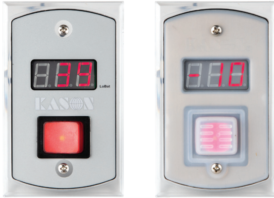
Shown with Wet Location Switch Cover