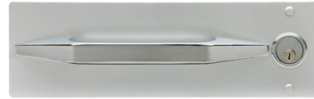
Keyed Latch (Outside)