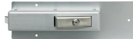
Keyed Latch (Inside)