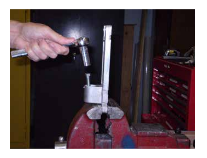
Drive the bolt into the cam.