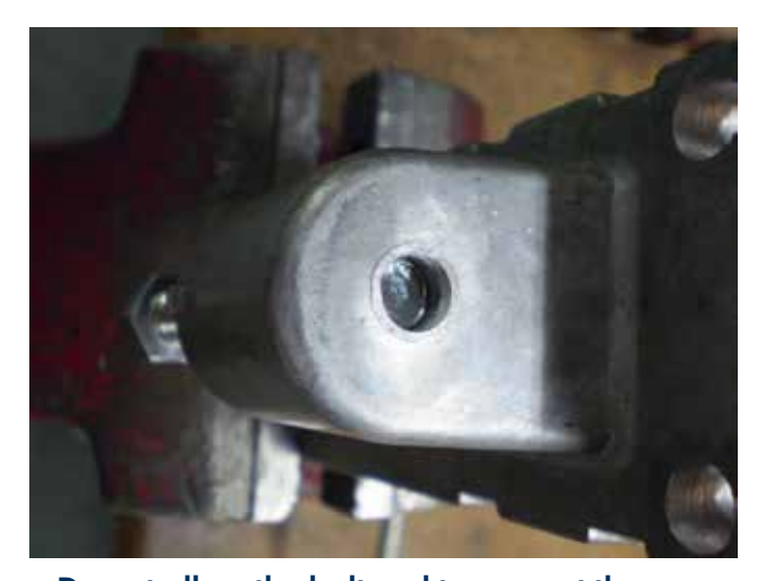
Do not allow the bolt end to go past the cam material into the metal body of the hinge flange. Only a few turns into the cam material are required.