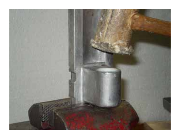
Tap in gently with hammer.