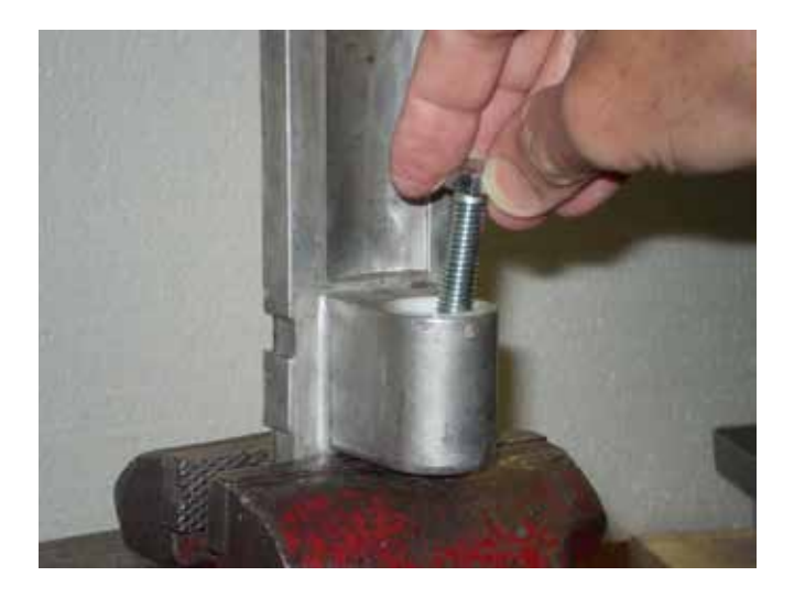
Obtain 3/8 bolt to be used as puller for removing cam. Insert the bolt into the hole in bottom of cam.

To replace worn 1345 assembly cam parts, proceed as follows: