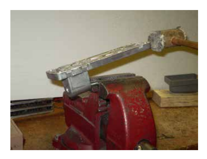
Secure the bolt head in a vise, tap the flange body gently with a hammer.