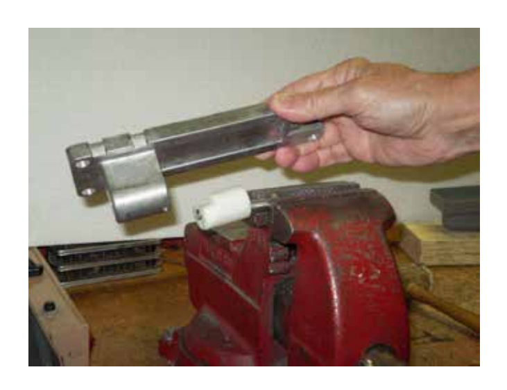
which should easily dislodge the old cam.