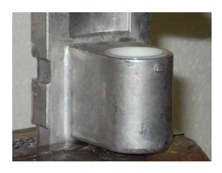
Until cam and flange surfaces are flush.