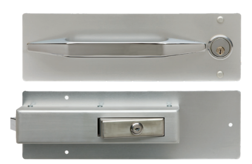
Optional: Keyless Inside Release Bypass Knob